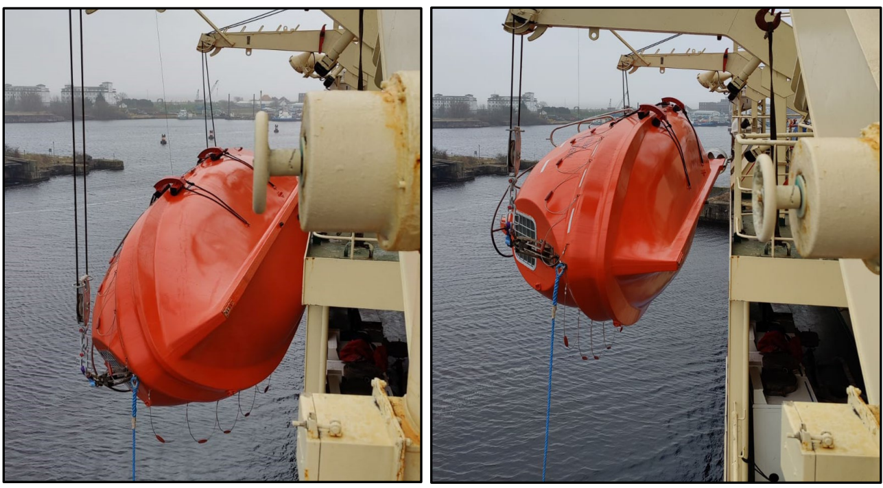
Figure 3 - Lifeboat listing more than 90 degrees w/ crew inside.